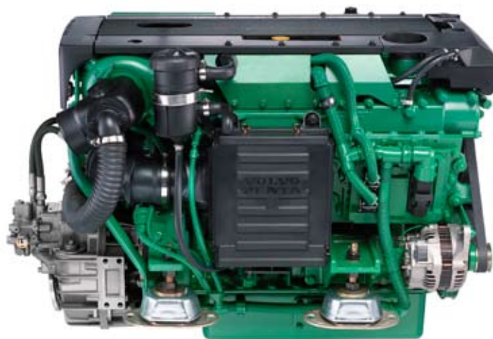
D4-180 with HS45AE reverse gear

Fully electronic world-class diesel performance, clean exhausts and low emissions achieved by common rail fuel injection, double overhead camshafts, and 4 valves per cylinder makes this engine the ideal choice for yacht comfort.